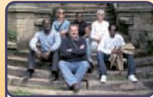
Volunteers on a day trip to Chatsworth house