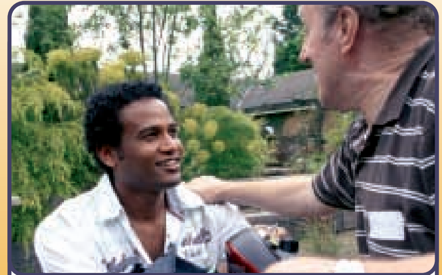
A volunteer helps disabled residents at Leonard Cheshire